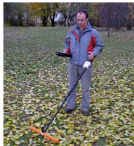
CMD – Tiny