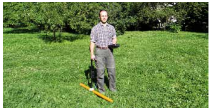
CMD – Mini Explorer