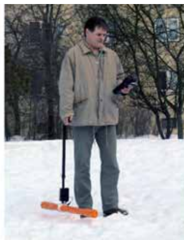
CMD – 1