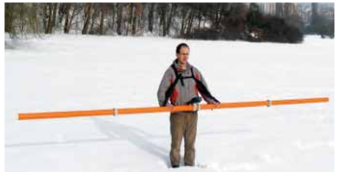
CMD – Explorer