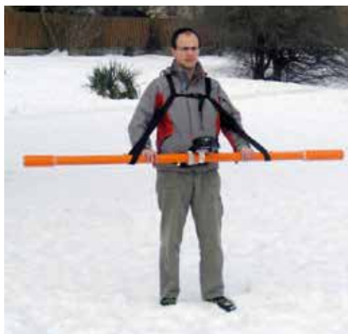
CMD – 2